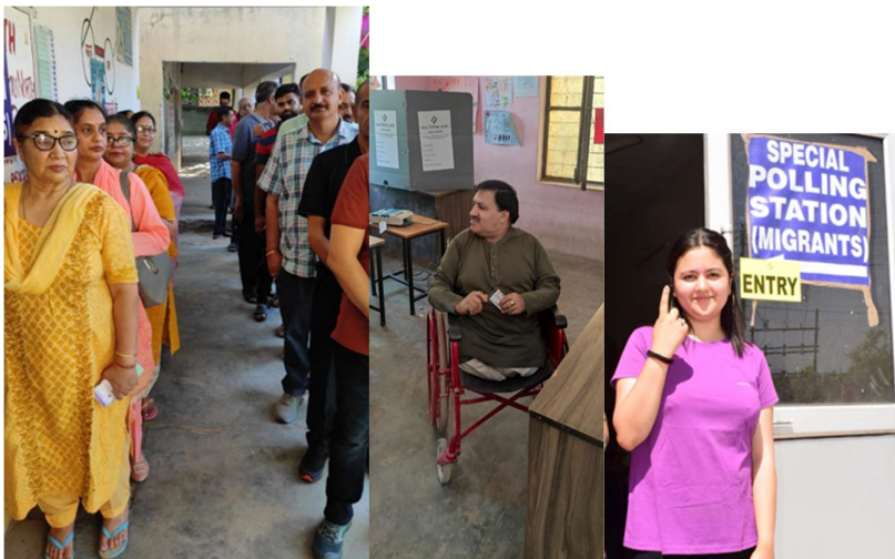
Migrant Voters at Special Polling Booths in Jammu, Udhampur and Delhi

There are 22 candidates in the fray in the Baramulla PC in the ongoing GE 2024. Polling personnel including security personnel worked tirelessly to ensure that an atmosphere of calm, peace and festivities welcomed voters at the polling stations. The Commission has enabled Kashmiri migrant voters residing at various relief camps in Delhi, Jammu, and Udhampur to also have the option of voting in person at designated special polling stations or using postal ballot. 21 Special Polling Stations were established at Jammu, 1 at Udhampur and 4 at Delhi.