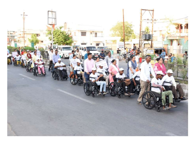
In Mehsana district in Gujarat, a wheelchair rally was organized by PwD electors to create awareness