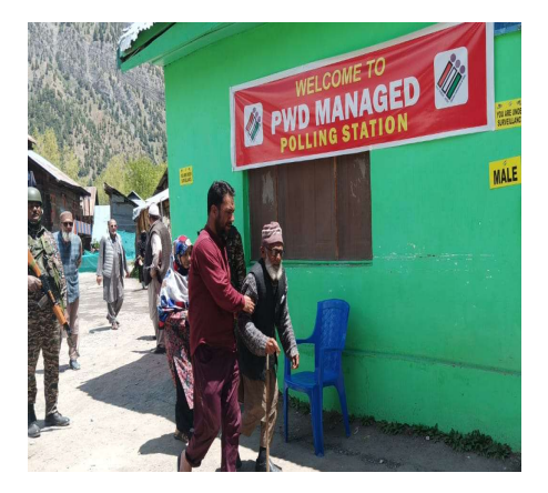
PwD managed PS in J&K