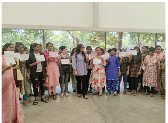
In Indore, Madhya Pradesh, 70 visually handicapped girls were assisted with free transportation to cast their vote.

The Commission has also made provisions for Braille on EVMs, Braille enabled EPIC, and voter slips to assist visually impaired electors. Further, a Voter Guide for PwDs and Sr. Citizens, in English and Hindi, with information on the process of registration to poll day facilitation was made available.