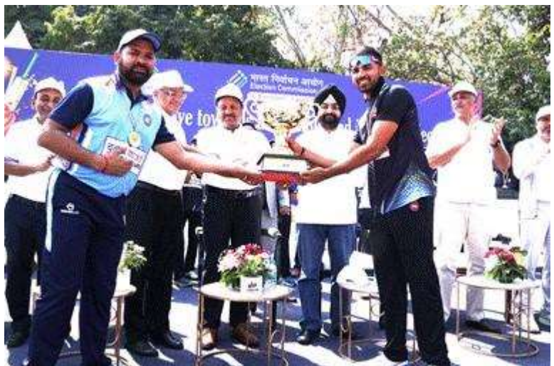
Commission awarding the trophy to the winners at the T-20 Match

As part of SVEEP initiatives, Commission organized a T-20 Cricket Match on 16th March, 2024 between the IDCA (Indian Deaf Cricket Association) and DDCA (Delhi District Cricket Association) teams to create voter awareness among PwD electors and promote inclusive elections.