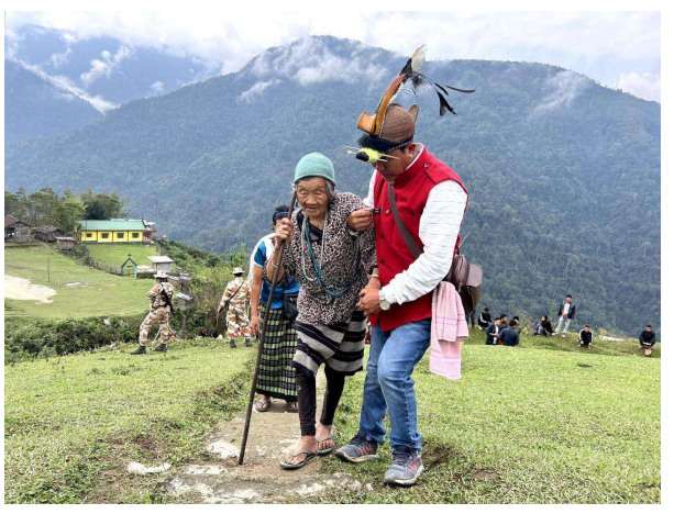
A senior citizen elector on the way to cast her vote in Arunachal Pradesh.

integrating the principles and practices of inclusivity and accessibility throughout the entire election process, setting an example before the society for replication everywhere."