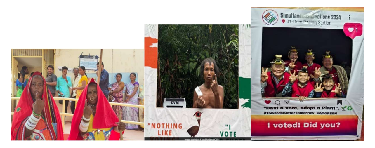
Lambada Tribe at Polling Station of Thiruvur Constituency, Shompen tribe of Great Nicobar voted for the first time in a General Election and Nishi Tribe in Arunachal Pradesh

The Election Commission of India has taken massive strides in ensuring inclusivity and accessibility in the General Elections 2024 to ensure that no eligible voter is deprived of their right to vote on account of physical or other barriers. So far, after the conclusion of 6 phases of elections, immense enthusiasm was seen amongst voters of various sections such as Persons with Disabilities, Senior Citizens, Transgenders, PVTGs. Facility for voting from the comfort of home for senior citizens above 85 years of age and PwDs with 40% benchmark disability was extended for the first time on pan India basis in General Elections 2024.