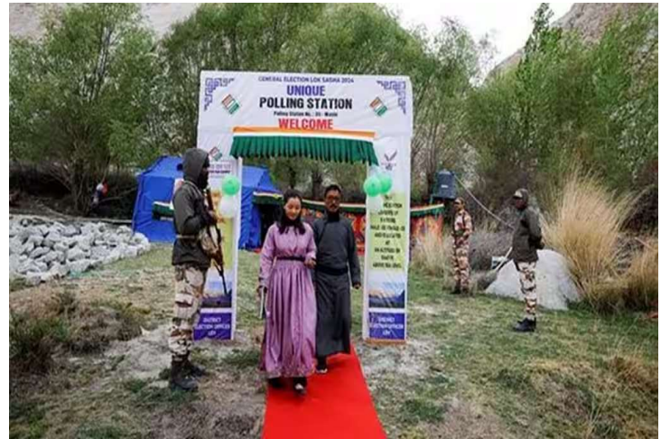
Polling station for just five members of a family in a remote village of Warshi in Leh district, Ladakh

The Commission is committed in ensuring that "no voter is left behind" and has taken special measures to reach out to the electors residing in the remotest corners of the county. For example, a polling station was set up in a shipping container in Aliabet in Gujarat to reach out to the tribal electors residing in this area. Similarly, voters from 102 villages in Bastar and Kanker PCs in Chhattisgarh cast their vote in a polling booth set up in their own village for the first time in a Lok Sabha Election.