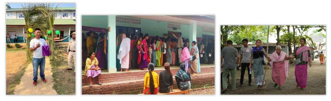
IDP in Manipur casting their vote at Special Polling Stations

Similarly, to ensure voting rights for internally displaced persons (IDPs) in Manipur, 94 Special Polling Stations (SPS) were set up in 10 districts for (IDPs). One SPS was set up in Tengnoupal district for a single voter. Poll was conducted under webcasting/videography and displaced persons staying outside relief camps could also opt to vote at SPS.