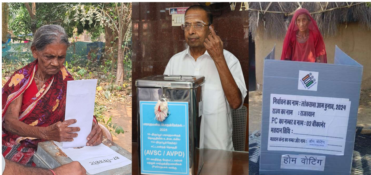
(85+ elderly voters exercising vote using home voting facility in Chhattisgarh, Tamil Nadu & Rajasthan)

In a pathbreaking initiative, the Election Commission of India (ECI), for the first time in a Lok Sabha Election, has provided the facility of home voting for the elderly and Persons with Disabilities in the 2024 Lok Sabha elections. Voters above 85 years of age and Persons with Disabilities (PwDs) with 40% benchmark disability can avail the optional home voting facility. Voters in this category have already begun casting their votes for phase I and II of polling. This initiative marks a significant stride towards ensuring inclusivity and accessibility of the electoral process and in bolstering democratic participation. There are over 81 lakh 85+ aged voters and 90 lakh + PwD voters registered across the country.