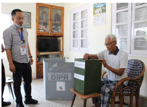
Senior citizens and PwDs casting their votes through postal ballot facility in Dimapur on 9th April 2024. (DPRO Dimapur)