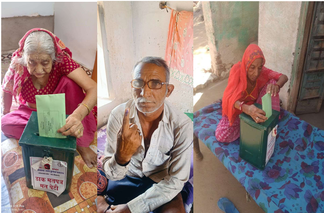
(Senior Citizens voting from home:)