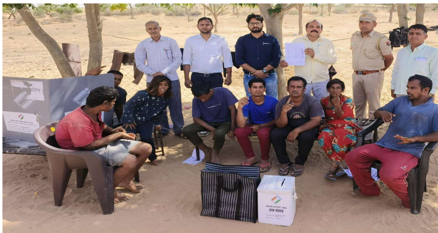
PwD voters in Churu Rajasthan