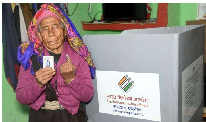
Elderly voters using home voting facility in Chamoli, Uttarakhand